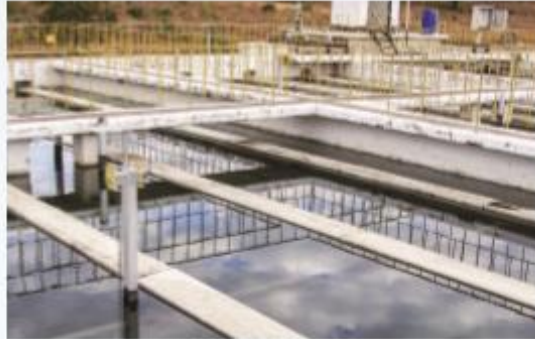
Kafue Water Treatment Works, Kafue