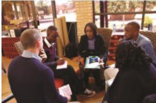
Strategy development workshop, July 2016

and project development, and capacity building.