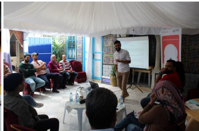
Drawing up a concrete plan for reviving the Souk al Mouajel

This project is supported by ifa (Institut für Auslandsbeziehungen) with funds from the Federal Foreign Office (Auswärtiges Amt)