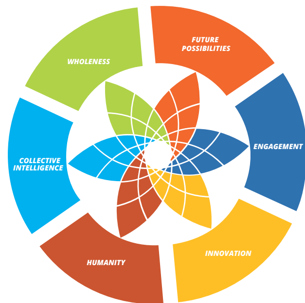
The Collective Leadership Compass © Copyright Petra Kuenkel

Our core approach is building functioning collaboration ecosystems by creating a culture of collective leadership. Our methodologies, based on our Collective Leadership Compass , focus on invigorating human interaction and networks to drive transition processes and help plan, enact and assess collaborative change. They strengthen individual leadership, enhance the leadership capacity of a collective and shift organisations or systems of collaborating actors towards better co-creation.